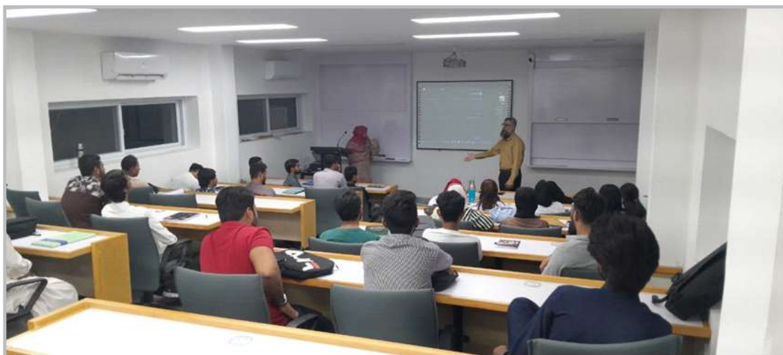
BSHINS fall session class in progress

By utilizing a combination of these assessment methods, the program can ensure comprehensive evaluation of students' knowledge, skills, and competencies in Health Informatics and Management System. Additionally, assessments should be aligned with program objectives and learning outcomes to ensure that students are adequately prepared for careers in the field.